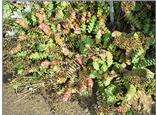
String Of Buttons

String Of Buttons is recommended for the following landscape applications;