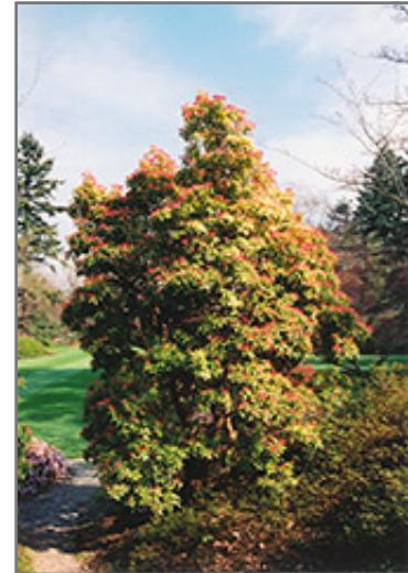
Valley Fire Japanese Pieris

This shrub does best in full sun to partial shade. It requires an evenly moist well-drained soil for optimal growth, but will die in standing water. It is very fussy about its soil conditions and must have rich, acidic soils to ensure success, and is subject to chlorosis (yellowing) of the foliage in alkaline soils. It is somewhat tolerant of urban pollution, and will benefit from being planted in a relatively sheltered location. Consider applying a thick mulch around the root zone in winter to protect it in exposed locations or colder microclimates. This is a selected variety of a species not originally from North America, and parts of it are known to be toxic to humans and animals, so care should be exercised in planting it around children and pets.