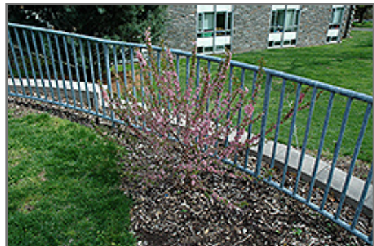
Dwarf Bush Cherry in bloom