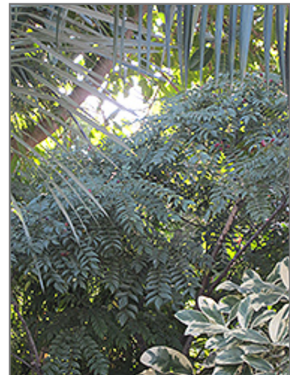
Curry Tree