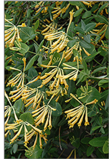
John Clayton Trumpet Honeysuckle flowers