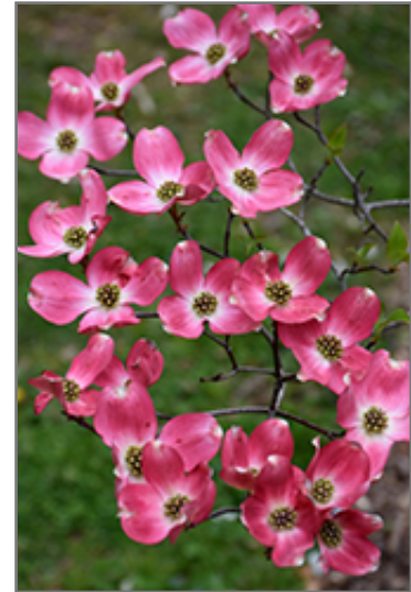
Red Flowering Dogwood flowers

Red Flowering Dogwood is recommended for the following landscape applications;