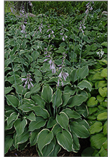
Ming Treasure Hosta in bloom