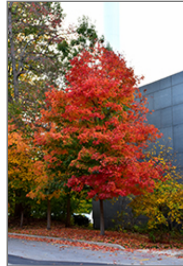
Fall Fiesta Sugar Maple in fall