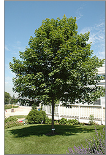
Fall Fiesta Sugar Maple

This tree should only be grown in full sunlight. It prefers to grow in average to moist conditions, and shouldn't be allowed to dry out. It is not particular as to soil pH, but grows best in rich soils. It is somewhat tolerant of urban pollution. This is a selection of a native North American species.