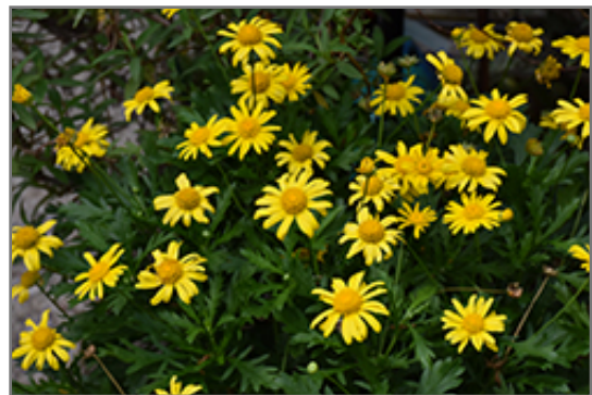
Sonnenschein African Bush Daisy flowers