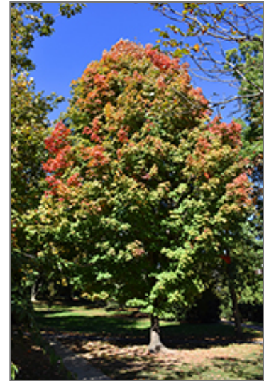
Endowment Sugar Maple