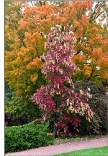
Sourwood in fall

This tree does best in full sun to partial shade. It does best in average to evenly moist conditions, but will not tolerate standing water. It is very fussy about its soil conditions and must have rich, acidic soils to ensure success, and is subject to chlorosis (yellowing) of the foliage in alkaline soils. It is quite intolerant of urban pollution, therefore inner city or urban streetside plantings are best avoided, and will benefit from being planted in a relatively sheltered location. Consider applying a thick mulch around the root zone in winter to protect it in exposed locations or colder microclimates. This species is native to parts of North America, and parts of it are known to be toxic to humans and animals, so care should be exercised in planting it around children and pets.