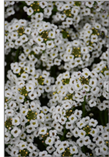
Stream White Sweet Alyssum flowers

Stream White Sweet Alyssum is recommended for the following landscape applications;