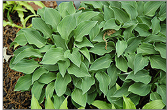
Tot Tot Hosta

Tot Tot Hosta is recommended for the following landscape applications;