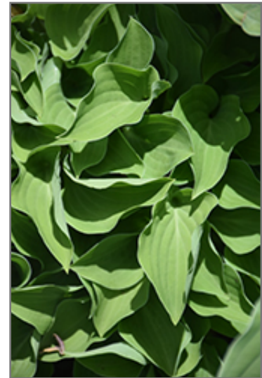
Tot Tot Hosta foliage