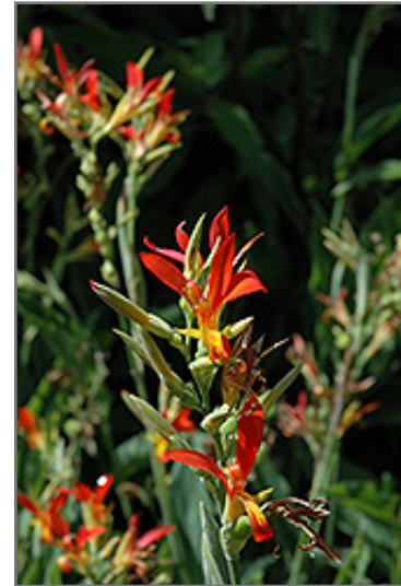
Indian Shot flowers

This plant should only be grown in full sunlight. It prefers to grow in moist to wet soil, and will even tolerate some standing water. It is not particular as to soil pH, but grows best in rich soils. It is highly tolerant of urban pollution and will even thrive in inner city environments, and will benefit from being planted in a relatively sheltered location. Consider applying a thick mulch around the root zone in winter to protect it in exposed locations or colder microclimates. This species is not originally from North America. It can be propagated by division.