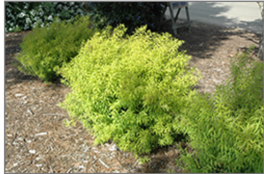
Mellow Yellow Spirea

This is a high maintenance shrub that will require regular care and upkeep, and should only be pruned after flowering to avoid removing any of the current season's flowers. It is a good choice for attracting butterflies to your yard, but is not particularly attractive to deer who tend to leave it alone in favor of tastier treats. It has no significant negative characteristics.