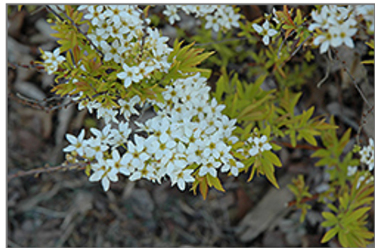
Mellow Yellow Spirea flowers