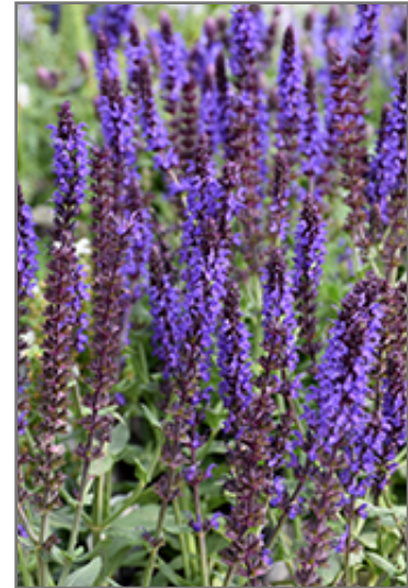
Lyrical Blues Meadow Sage flowers

This is a relatively low maintenance plant, and is best cleaned up in early spring before it resumes active growth for the season. It is a good choice for attracting butterflies and hummingbirds to your yard, but is not particularly attractive to deer who tend to leave it alone in favor of tastier treats. It has no significant negative characteristics.