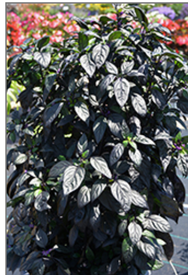
Black Pearl Ornamental Pepper