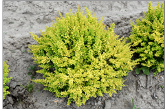
Sunsation Japanese Barberry

Sunsation Japanese Barberry is recommended for the following landscape applications;