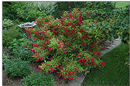
Red Prince Weigela in bloom