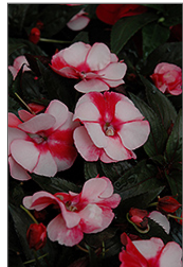
Sonic Sweet Cherry New Guinea Impatiens flowers