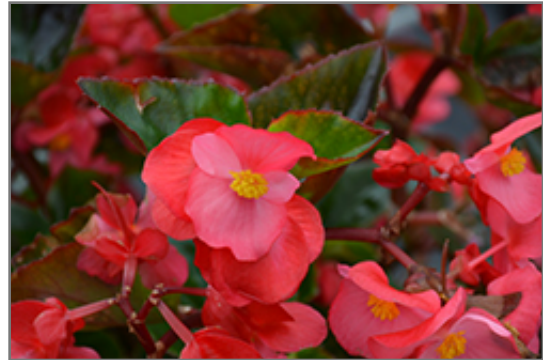
Big Rose Green Leaf Begonia flowers

Big Rose Green Leaf Begonia is recommended for the following landscape applications;