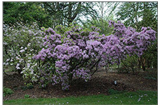
Yunnan Rhododendron in bloom