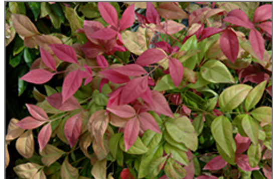
Blush Pink Nandina foliage

Blush Pink Nandina is recommended for the following landscape applications;