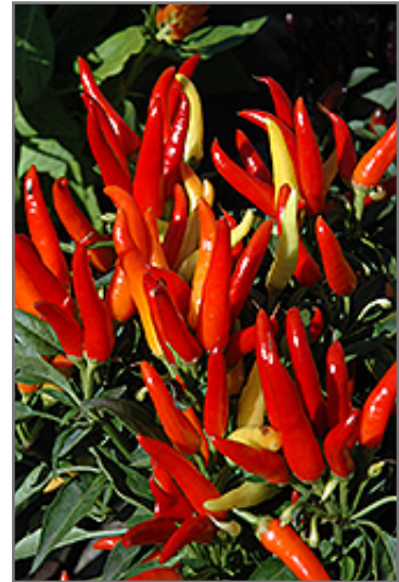
Chilly Chili Ornamental Pepper fruit

Chilly Chili Ornamental Pepper is an herbaceous annual with an upright spreading habit of growth. Its medium texture blends into the garden, but can always be balanced by a couple of finer or coarser plants for an effective composition.