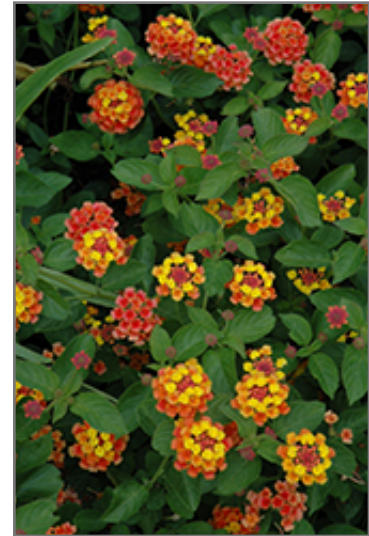
Landmark Citrus Lantana flowers