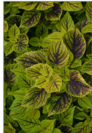
Gays Delight Coleus foliage