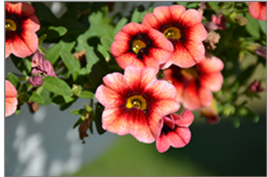
Superbells Coralberry Punch Calibrachoa flowers

Superbells Coralberry Punch Calibrachoa is a dense herbaceous annual with a trailing habit of growth, eventually spilling over the edges of hanging baskets and containers. Its medium texture blends into the garden, but can always be balanced by a couple of finer or coarser plants for an effective composition.