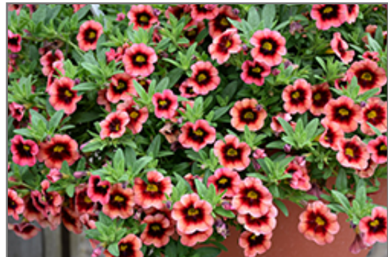
Superbells Coralberry Punch Calibrachoa flowers