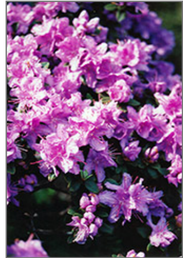
Ramapo Rhododendron flowers