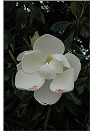
Teddy Bear Magnolia flowers