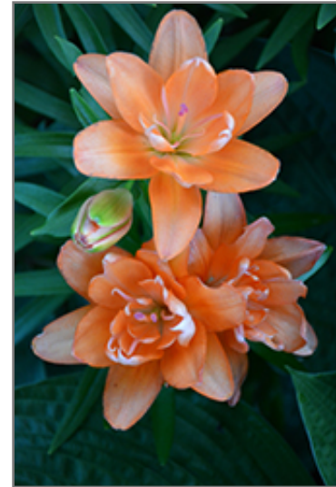
Lily Looks Tiny Double You Lily flowers

Lily Looks Tiny Double You Lily is recommended for the following landscape applications;