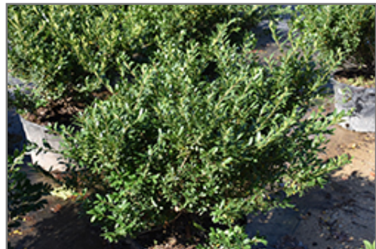
Hoogendorn Japanese Holly