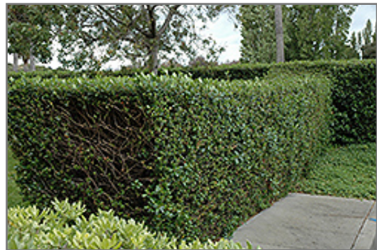
Red Escallonia