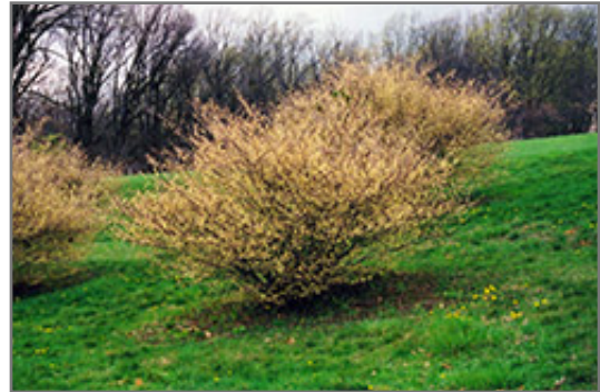
Fragrant Winterhazel in bloom