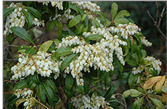
Red Mill Japanese Pieris flowers

Red Mill Japanese Pieris is recommended for the following landscape applications;