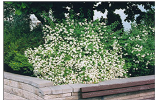
Galahad Mockorange in bloom