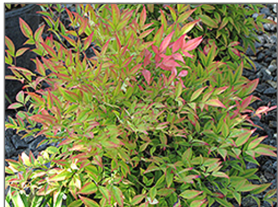
Moon Bay Dwarf Nandina