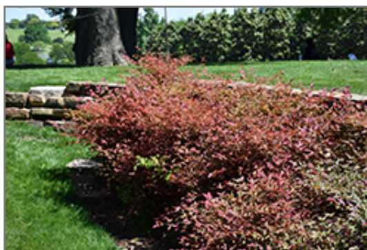
Flirt Nandina

Flirt Nandina is recommended for the following landscape applications;