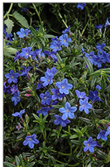
Grace Ward Lithodora flowers