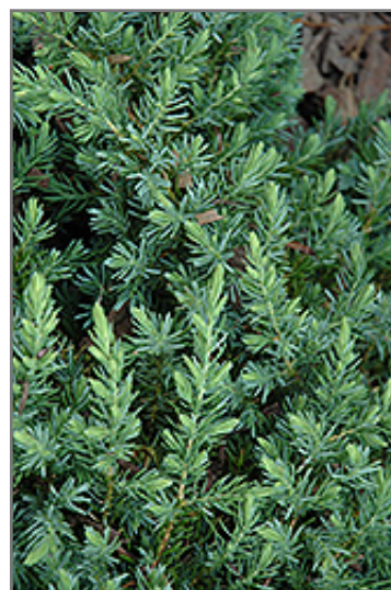
Blue Pacific Shore Juniper foliage

Blue Pacific Shore Juniper is recommended for the following landscape applications;