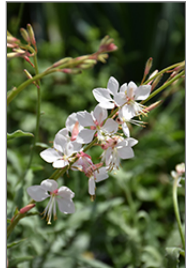
Whirling Butterflies Gaura flowers

Whirling Butterflies Gaura is an open herbaceous perennial with tall flower stalks held atop a low mound of foliage. It brings an extremely fine and delicate texture to the garden composition and should be used to full effect.