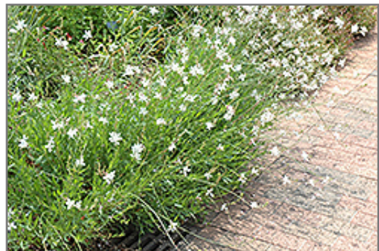
Whirling Butterflies Gaura in bloom