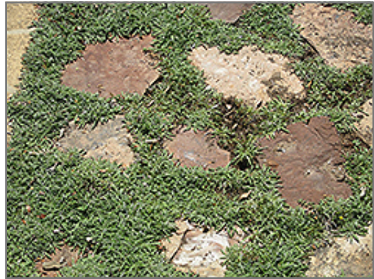
Silver Carpet