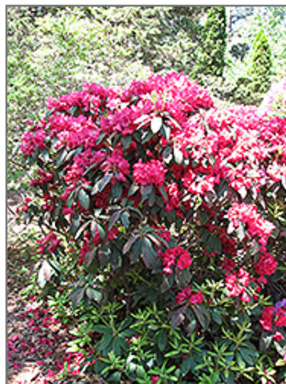
Trilby Rhododendron in bloom