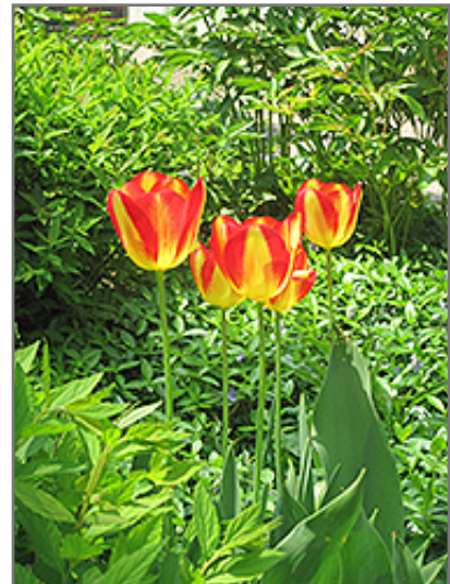
Antoinette Tulip in bloom