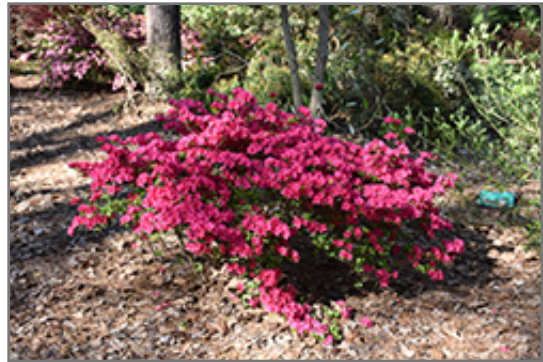
Girard's Fuchsia Evergreen Azalea in bloom