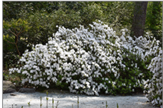
Delaware Valley White Azalea in bloom