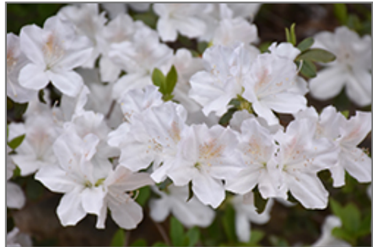
Delaware Valley White Azalea flowers

Delaware Valley White Azalea is recommended for the following landscape applications;