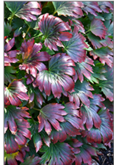
Crimson Fans Mukdenia foliage

This is a relatively low maintenance plant, and is best cleaned up in early spring before it resumes active growth for the season. It has no significant negative characteristics.