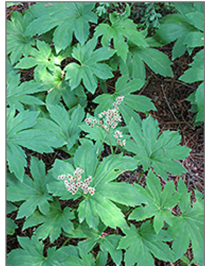
Crimson Fans Mukdenia flowers

Crimson Fans Mukdenia will grow to be about 12 inches tall at maturity extending to 18 inches tall with the flowers, with a spread of 24 inches. When grown in masses or used as a bedding plant, individual plants should be spaced approximately 20 inches apart. Its foliage tends to remain dense right to the ground, not requiring facer plants in front. It grows at a medium rate, and under ideal conditions can be expected to live for approximately 10 years. As an herbaceous perennial, this plant will usually die back to the crown each winter, and will regrow from the base each spring. Be careful not to disturb the crown in late winter when it may not be readily seen!