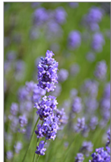
Hidcote Blue Lavender flowers