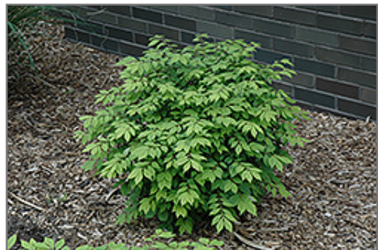
Little Moses Burning Bush