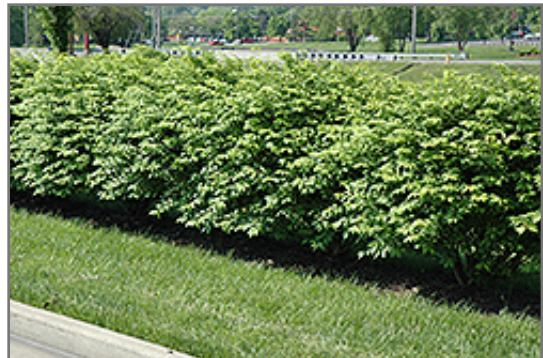
Cole's Compact Burning Bush