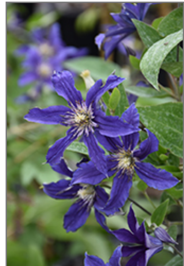
Sapphire Indigo Clematis flowers